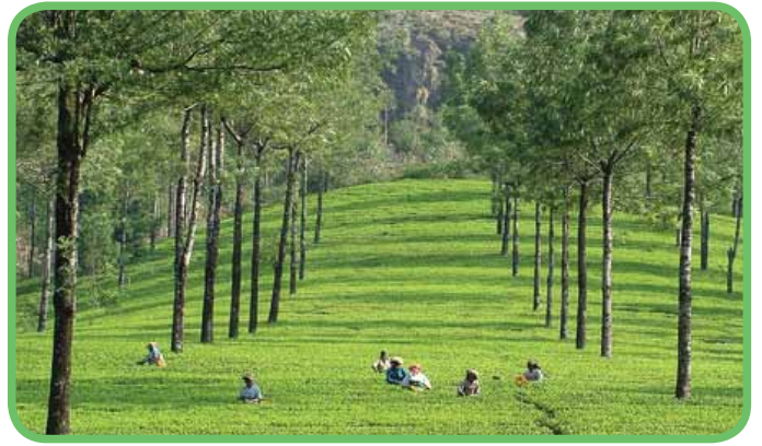
Labour Relationship Management